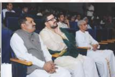
The audience listening to the Key Note address