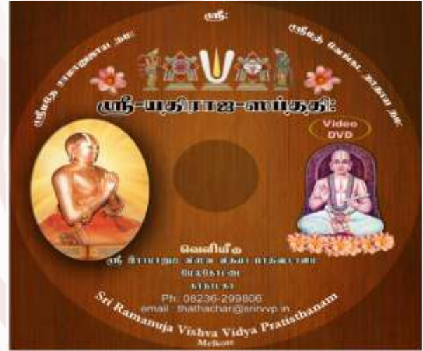
Front Cover of the completed Yatiraja Saptati Tamil CD

1. The commentary of Pillai Lokam Jeer, 2. The commentary of Doddayyācharya, 3. Munindra Bhāva Prakāshikā. All these commentaries are written in manipravālam style. This volume on Yatirāja-Vimshati consists of all these three commentaries in manipravālam style and the kannada translation of the commentary of Pillai Lokam Jeer.